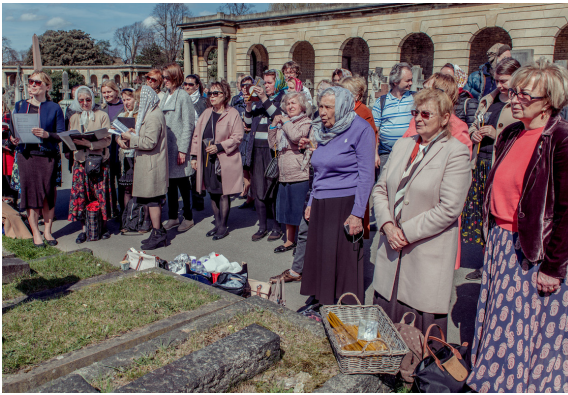
During panikhida of the ever-memorable Metropolitan Anthony (Bloom) at Brompton cemetery