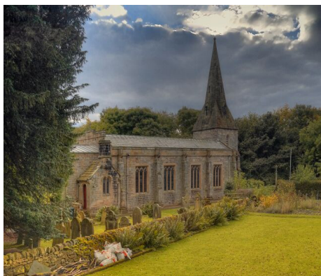
St John's ('St John Lee') Church in Acomb, Northumb.