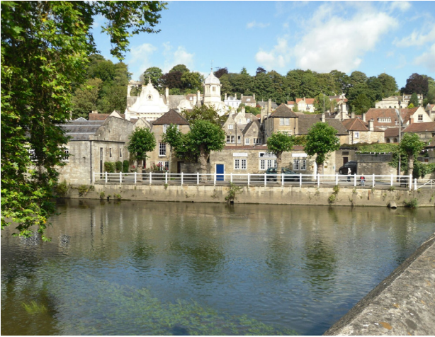
A view of Bradford-on-Avon, Wilts

St Laurence's was gradually forgotten and services stopped there.