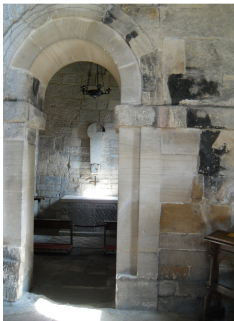
Inside the Saxon St Laurence's Church, Bradford-on-Avon, Wilts

by candlelight inside, and its interior is simple with a homely atmosphere – a typical church of the early Orthodox Englishmen! It is built of yellowish stone with thick walls.