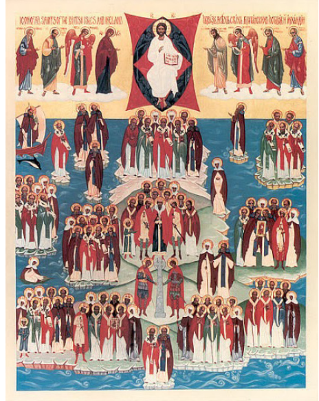
Icon of All Saints who shone forth in the lands of Britain and Ireland

and vice versa—numerous missionaries, enlighteners, left the British Isles and moved to other European lands to preach and found monasteries.