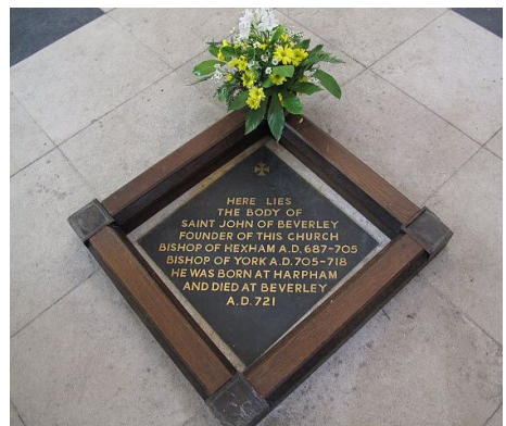
St John's grave inside Beverley Minster, E. Yorkshire

St John. Kings prayed to John before decisive battles and asked for his intercession. Many doctors sought the assistance of St John. In the middle ages the church of Beverley was collegiate – that is, with a community of secular canons (rather than monks) attached to it. Despite the Reformation this glorious saint is still the patron - saint of the town of Beverley in the East Riding of Yorkshire. A church dedicated to St John stands in his birthplace at Harpham where there is also the holy well which bears his name. Historic churches in honour of John of Beverley can be found in Salton (North Yorkshire), Wressle (East Riding of Yorkshire), Scarrington and Whatton-in-the-Vale (both in Nottinghamshire), Acomb (Northumberland; he lived here as a hermit). It is likely that they were originally founded by St John himself. Modern Catholic churches are