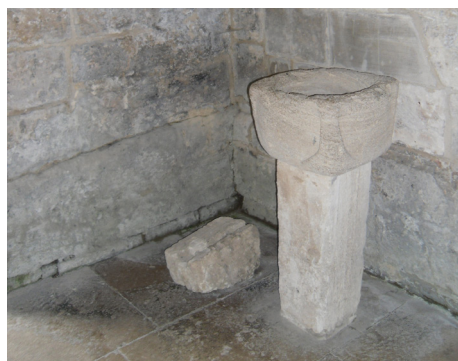
The font inside St Laurence's Saxon Church in Bradford-on-Avon, Wilts

St Laurence's was rediscovered not so long ago and 'by accident'! In 1001, King Ethelred gave the land and church at Bradford to the nuns of Shaftesbury Abbey in Dorset where the relics of St Edward the Martyr were kept. According to some traditions, St Laurence's may have kept the relics of St Edward or even of St Aldhelm for some time. Thanks to the influence of Shaftesbury this church has some late Saxon and early Norman elements. Worship continued here for many centuries, but in time