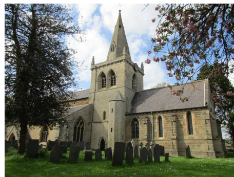
St John's Church in Whatton-in-the-Vale, Notts