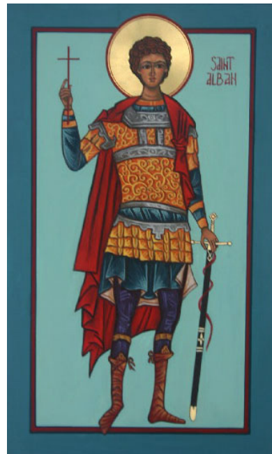
St Alban

It is here that I wish to speak of England and her hallowed ones who stand in this Kingdom of Heaven and I would like to consider the significance of our land, one of the most ancient of Christian lands, in this light. For there stands in Paradise a holy company of Englishmen and Englishwomen, who in their earthly lives confessed a noble and a gentle faith, an English faith, which encompassed all that is finest and most beautiful, all that is spiritually fragrant in the heart of this people. There stands St. Alban, who