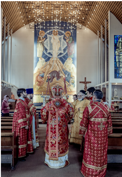
At the Parish of St Xenia of St Petersburg in Leeds