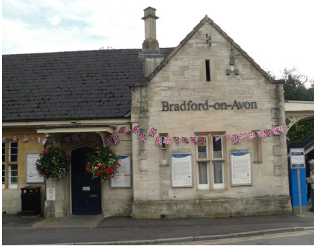
The railway station in Bradford-on-Avon, Wilts

The beautiful ancient little market town of Bradford-on-Avon (Bradford meaning 'broad ford') stands close to the Somerset-Wiltshire border in south-western England. It is situated on an elevation in a picturesque setting between the Mendips, the Salisbury Plain and the Cotswold Hills. Bradford's curving narrow paved streets run up a hill. Its architecture has Dutch features as in ancient times it was rebuilt by Flemish weavers. It has two canals, and there are many mansions and caves in the vicinity. The town's main industry was weaving smooth woolen cloth. Once Bradford boasted 300 mills; today fine Tudor, Jacobean and Georgian houses remind us of its weavers' wealth.