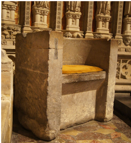
The ancient cathedra (chair) at Beverley Minster, Beverley, E. Yorkshire