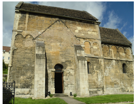
The Saxon Church of St Laurence in Bradford-on-Avon, Wiltshire

The true gem of Bradford is the tiny Saxon Church of the holy Archdeacon Laurence of Rome, one of the most complete Saxon churches in England, built about 700 by St Aldhelm. Aldhelm was bishop of Sherborne and abbot of Malmesbury. He is honoured as a scholar, teacher, preacher, builder of churches in Wessex, expert in Latin and some Greek, talented musician (he played the harp, composed and sang songs), author of books, treatises, poems, letters and even a collection of riddles! The prayerful spiritual presence of this saint is still strong in this ancient shrine with its mysterious atmosphere. It is a miracle that St Laurence's was built in the Orthodox period of English history and has not changed much since then! You will not see Norman or Gothic architecture here. On the contrary, the church is tall, high, with small windows, lit only