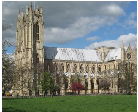
Beverley Minster, E. Yorkshire