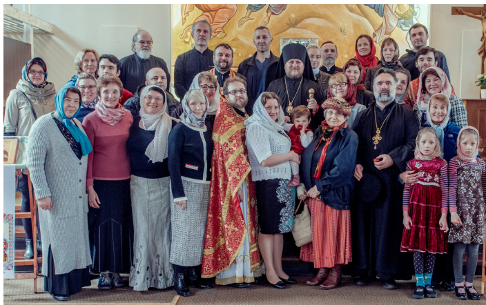
At the Parish of St Xenia of St Petersburg in Leeds