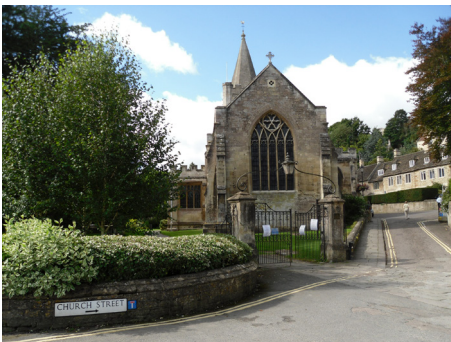
The 900-year-old Holy Trinity Church in Bradford-on-Avon, Wilts

- The early twelfth century Holy Trinity Church across the road from St Laurence's, preserving the second