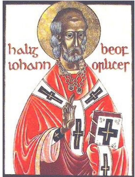
Icon of St John of Beverley

St John was born at Harpham in Yorkshire in the kingdom of Northumbria to a noble family in the mid-seventh century. As a young man he obtained an excellent education, studying at the renowned seminary of Canterbury. There he learned Greek and Latin, mathematics, astronomy, Church music, poetry and medicine. Knowledge of medicine helped him cure many people from diseases. However, secular life did not attract the young man. John was tonsured as a monk and returned to his native Yorkshire. He joined Whitby Monastery under St Hilda where he learned the spiritual life. The young monk spent much time in the large monastery library and became noted as a commentator on the Holy Scriptures. In 687 St John became Bishop of Hexham. A bishop's life means tireless labours in his diocese, and John bore this cross perfectly. However, his heart was drawn to the solitary life of a hermit. On the bank of the River Tyne there was a quiet cemetery with a chapel of the Archangel Michael. Every year John used to go to that spot for prayer. He liked to spend Lent there, when he used to distribute alms. The holy ascetic used to ask his disciples to