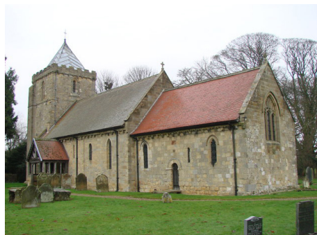
St John's Church in Salton, N. Yorkshire