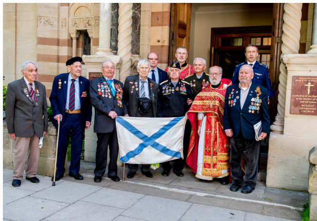
A delegation of veterans of the Great Patriotic War from Russia