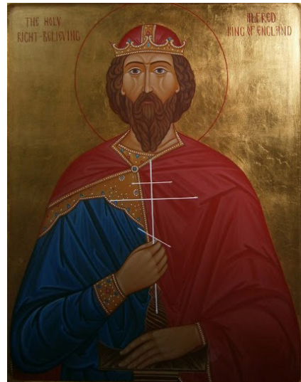
Alfred the Great

There also stands Alfred, who is called “the Great” and who became a