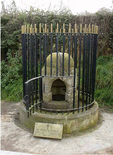
St John's well in Harpham, E. Yorkshire

life in peace and quiet. The gentle Bishop John died on 7 May, 721, the day before the feast of St John the Evangelist. His veneration began right after his death and many cases of miracles were recorded. John loved Beverley dearly and in effect he was the founder of this town. Down the centuries the faithful called him not 'St John of York' but 'St John of Beverley'. Throughout the Middle Ages John remained one of the greatest saints of northern England and as one of the national protectors. Many criminals who managed to escape justice had the right to go to Beverley and find refuge there. There are many examples of protection of monks and townsfolk of Beverley from different troubles by