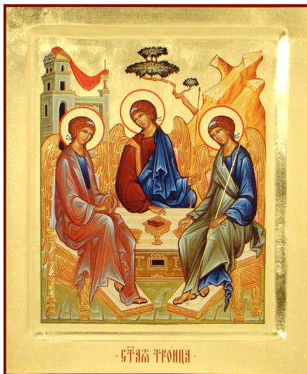
Icon of the Holy Trinity

On the 50th day after the Holy Resurrection of Jesus Christ all Orthodox Christians celebrate the day of the Holy Trinity. It is also known as Pentecost.