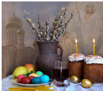
Фото - протоиерея Андрея Ткачева

The Myrrh-bearing Women, Mary Magdalene, Mary of Cleopa, Salome, Joanna, Martha and Maria, Susanna and others came on the third day after the Crucifixion in order to anoint the body of Christ with fragrant myrrh (a special oil). They came to the tomb of Christ early in the morning and found it empty. 'And entering the tomb, they saw a young man clothed in a long white robe sitting on the right side;