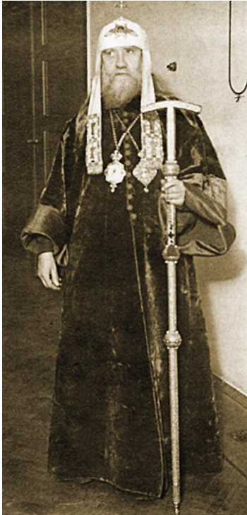
One of the first photographs of Patriarch Tikhon

You have taken away from the soldiers everything for which they had valorously fought. You have taught them, only recently brave and invincible, to leave off protecting the Motherland and to run from the field of battle. You have extinguished in their hearts the inspiring consciousness that there is no greater love than should one lay down his life for his friends (Jn. 15:13). You have traded the Fatherland for soulless internationalism, although you yourselves know perfectly well that when it comes to defending the Fatherland, the proletarians of all