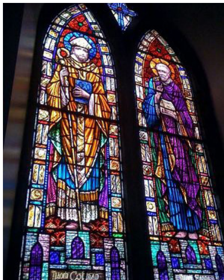
Stained glass image of Sts Enda of Inishmore and Colman of Kilmacduagh

The fame of Enda spread far and wide. The loving care of the holy abbot was directed not only toward monks, but also to the poor, the oppressed and suffering. He ordered the monks to build eight places for refuge on the island, where all who had nowhere else to go could find shelter and care.