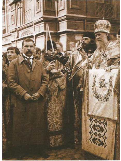
Patriarch Tikhon during Moleben outside Nikolskie gates. Moscow, 1918

violation of freedom in matters of faith. Not a day goes by when the most monstrous slanders against Christ's Church and her servants are not published in the agencies of your press, along with malicious blasphemy and mockery. You deride the servants of the altar, force bishops to dig trenches, and send priests to do dirty work. You have raised your hand against the Church's inheritance gathered through many generations of the faithful, and have given no thought to violating their posthumous will. You have closed a large number of monasteries and churches without any excuse or reason. You have blocked access to the Moscow Kremlin—that sacred inheritance