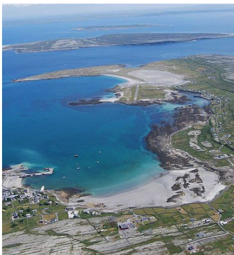
Aran Islands

and even ‘beehive-cells’. Notable are the remains of ‘the seven churches’ in the west of the island; the site of Killeany Monastery in the eastern corner; and Teaghlach cinne - a fine