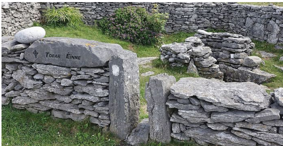
St Enda’s well on Inisheer