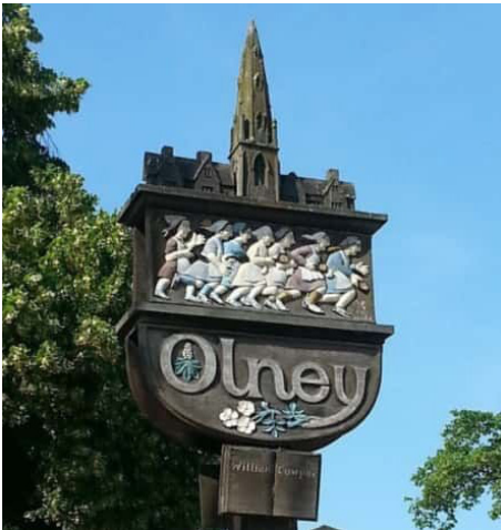
Pancake run depicted on the Olney town sign

(What we call Pussy-Willow Sunday in Russia is called Palm Sunday in England as they use palm twigs on that day). Palm Sunday was also called 'Fig Sunday', for on this day figs, the fruit of the palm, would be eaten in pies and puddings. Donkeys were treated with special kindness on this day. Incidentally, the cross-shaped mark on the backs of donkeys is said to come from the fact that the Lord rode upon a donkey. Holy Thursday was kept with great piety, just as Good Friday. Even in my childhood all shops were closed on Good Friday - except the baker's for hot cross buns (see below). It was called 'Good' from the old meaning of the word 'good', signifying holy or spiritual, as is still the case when we call the Bible 'the Good Book'. The elder was a tree never used by carpenters because it was said to be the tree from which Judas hanged himself and was called 'the Judas tree'. On the other hand if the aspen tree is popularly called 'the shiver tree' it is because Christ was crucified on one. So to this day it shivers with shame and horror. On the English borderlands the Skirrid was said to be a holy mountain and the