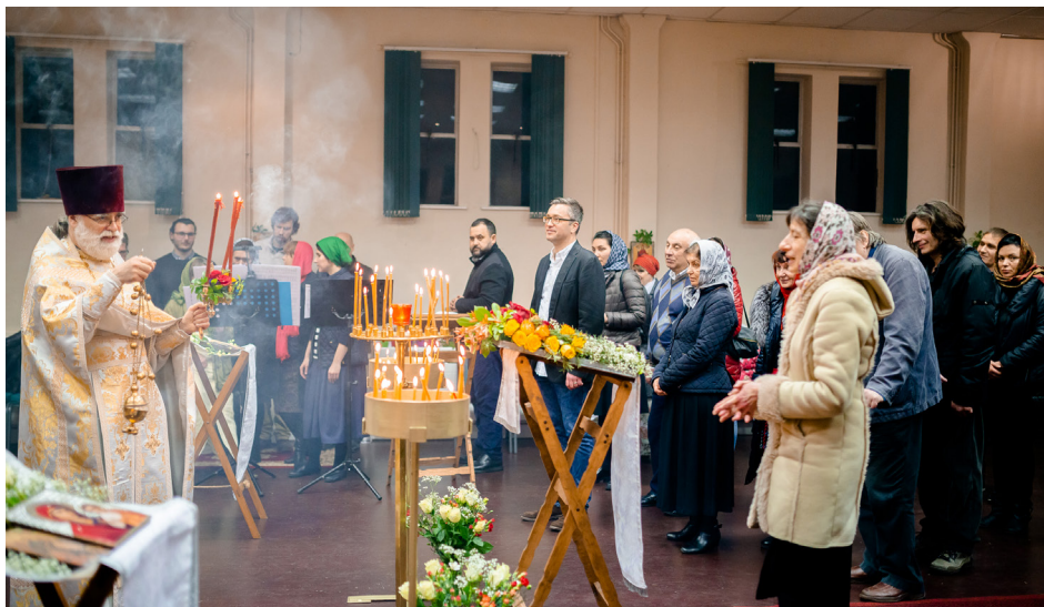
Above and below - Parish of St Silouan of Mt Athos in Southampton

procession returned to the temple, the Divine Liturgy began: as many as 50 people persisted through the night until early morning. Afterwards a modest and quiet collation had been prepared. On Sunday, Vespers was celebrated at 1.00 pm, followed by a festal meal