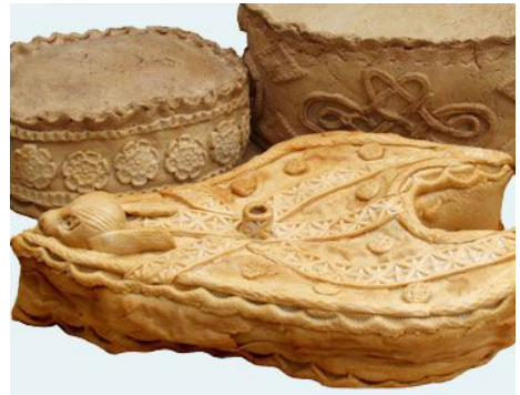
A pie in a shape of a rabbit

Just as the Russians have eggs blessed at Easter, so in England 'pace-eggs' (paschal eggs) were blessed in church before they were eaten. In some places the tradition of 'pace-egg rolling' still continues - consisting of rolling paschal eggs down slopes of hills in play. These eggs represented the stone that was rolled away from Christ's Tomb. On Easter Sunday, often called 'God's Sunday' or 'Holy Sunday', one always wore something new (the 'Easter