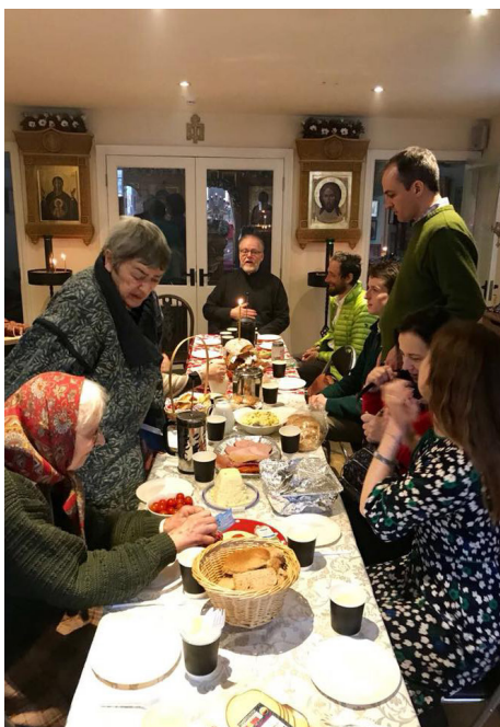
Breakfast after Paschal Liturgy at the Church of St. Nicholas the Wonderworker in Oxford