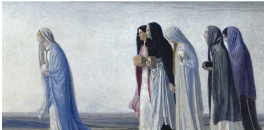
Myrrbearing women, inconvenient witnesses