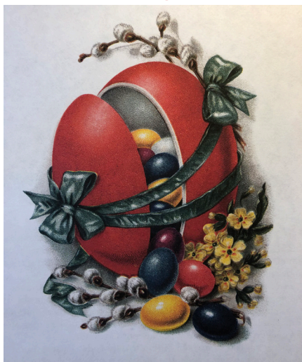
Illustration from a prerevolutionary children magazine 'Svetlyachok'

Christ is risen from the dead, trampling down death by death, and on those in the tombs bestowing life!