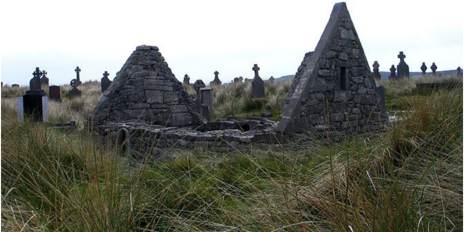
Monastic ruins 'Teaghlach Einne' in Inishmore

Despite all this, the memory of St Enda lives on in Inishmore, where numerous ruins and parts of his early monasteries and churches survive. Some buildings can be traced back to the time of the saint. Among the shrines are sections of monastic walls, remains of towers