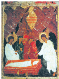
Мироносицы у Гроба

развалинах Кесарии Палестинской был обнаружен «камень Пилата», на котором сохранилась надпись: