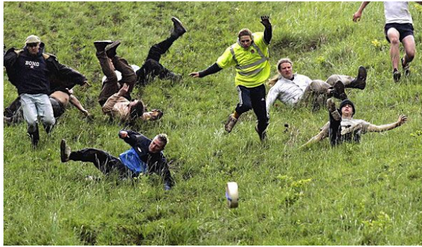
Cheese - rolling